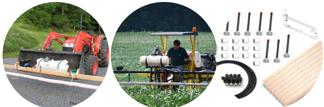
Product Part # MSRP

Build your own boom to meet your needs. Kits include sponges in 30" sections, risers to attach to boom, a manifold and plumbing (no metal)