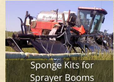
Sponge Kits for Sprayer Booms