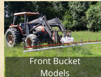
Front Bucket Models