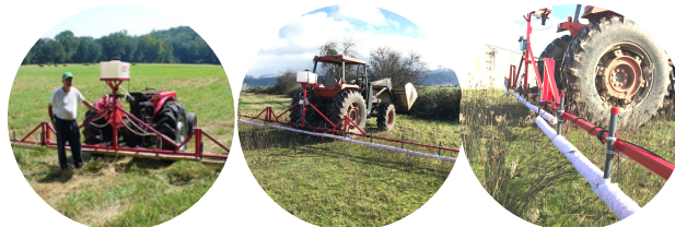
Product Part # MSRP

Best for Row Crop applications. Heavy duty frame. The wings fold for road position. Adjust the height on the go with your 3 point hitch.