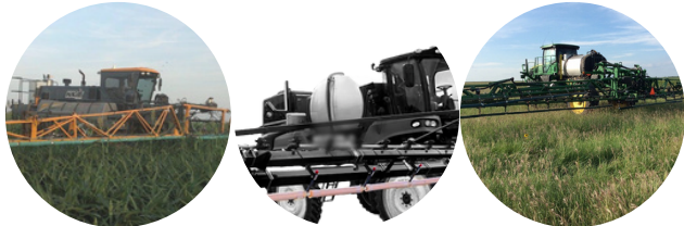
Product Part # MSRP

Adapts to any size boom, connects to TeeJet bodies, no welding to boom, brackets bolt on, includes extra sponges sections, easily change from wiper to sprayer