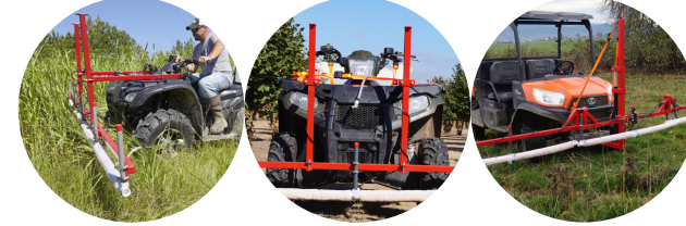
Product Part # MSRP

Great for pastures, orchards and areas that you need the versatility of an ATV/UTV. Manually adjust the height, or adjust with optional electric Powerlift.