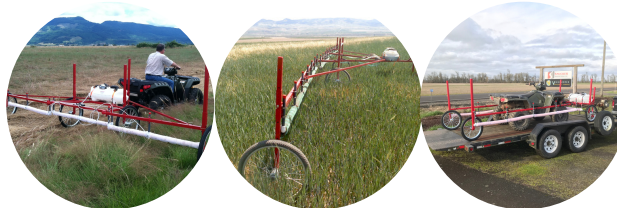
Product Part # MSRP

Wheels & a flex frame design contours to the terrain, maintaining uniform sponge height.