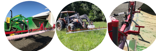
Product Part # MSRP

Applying chemical to the weeds before the tires run them over. Easy to see and you can adjust the height on the go.