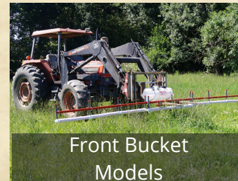
Front Bucket Models