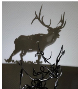
The Light of Jesus shining through our "mess" changes everything