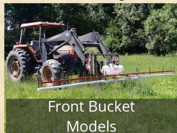
Front Bucket Models